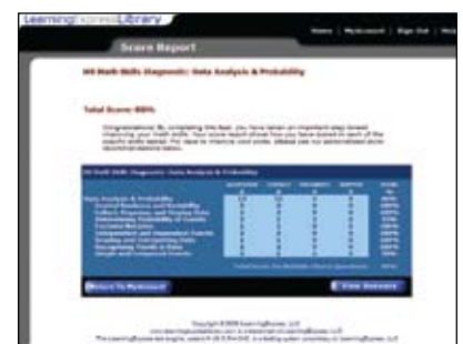
Instant diagnostic score report